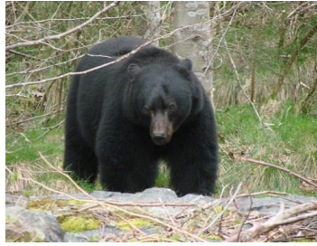
Boar Black Bear