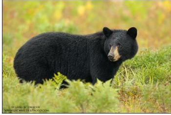
Sow Black Bear